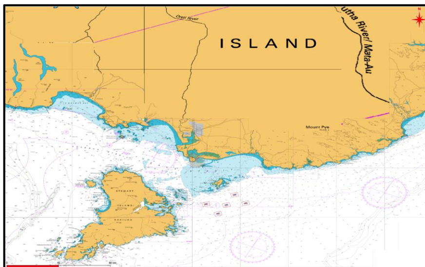
Figure One: the five farming areas that make up Project South are circled in red, and exaggerated in size so that they can be picked up on this chart.

A Sanford has been working with ecological experts to ensure that Project South will not affect marine mammals and seabirds; for example, we will distribute the feed to the fish under water rather than above the surface. There are many new innovations that we will be able to use.